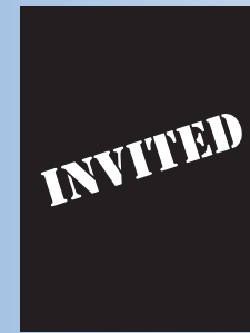
The Honourable Michael Wilson - invited Canadian Ambassador to the United States