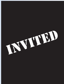
The Honourable Maxime Bernier - invited Minister of Industry

Maxime Bernier was appointed Minister of Industry after his election for the first time in 2006. As a lawyer, he has occupied senior management positions in the financial and banking sector and was until recently Executive Vice President of the Montreal Economics Institute.